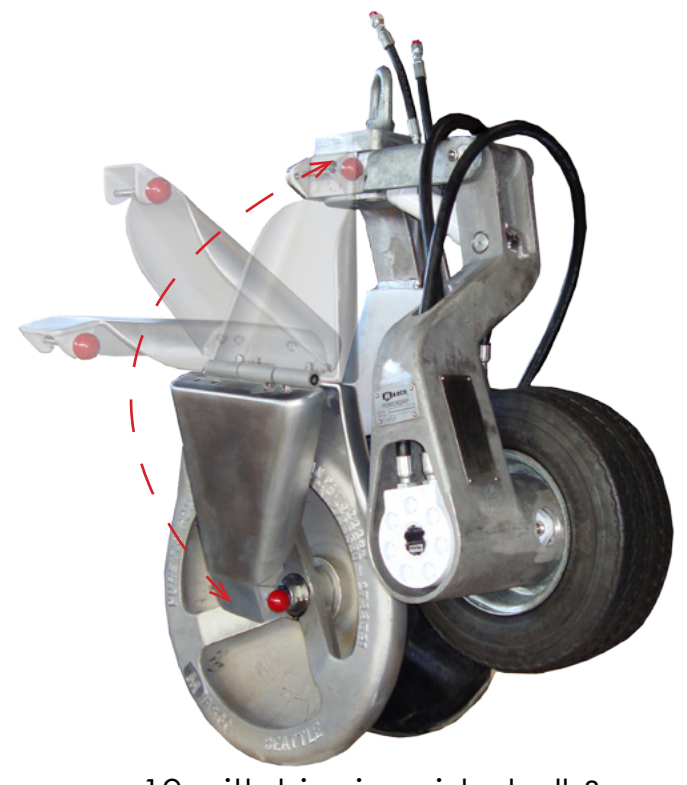
19 with hinging sideshell & standard Powergrip