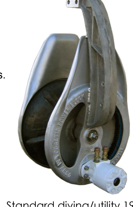
Standard diving/utility 19

The addition of an optional powergrip can increase traction as it will put pressure on the hose, lead or line that is being retrieved for more positive grip by the sheave. A number of different styles of grips are available. Powergrip tire rims are galvanized for long service life in a saltwater environment.